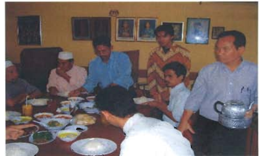
The Codifiers enjoying their lunch.