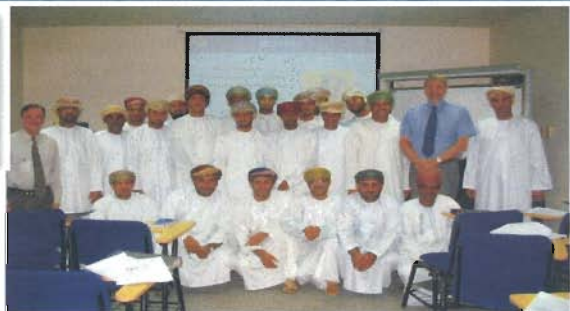
Oman Logistic officers attending the codification course.

Besides the NATO nations, there are 29 countries (including Malaysia) that operate the NATO Codification System (NCS) to one degree or another. AC/135 (NATO Group of National Directors on Codification) welcomed Morocco as a Tier 1 sponsored country and signed a sponsorship agreement during the 91 st Main Group Meeting. Only recently, applications have been received from Afghanistan and Georgia. AC/135 will be organizing codification workshop in Sweden and Chile. The Sultanate of Oman is in the process of developing their codification capability. AC/135 had provided assistance to conduct codification training course for their logisticians recently.